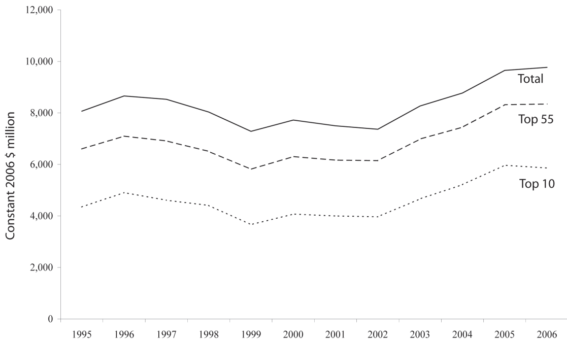
Figure 1. California's agricultural exports, 1995-2006

Note: The aggregation "Top-55 products" includes only 50 products from the years 1995-2000. In 2001 the added 5 commodities contribute $57 million.